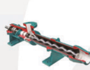
PROGRESSIVE CAVITY PUMPS