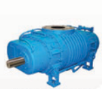
PD BLOWERS & VACUUM BOOSTERS