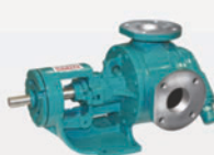
ROTARY GEAR PUMPS