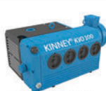
ROTARY VANES & CLAW PUMPS