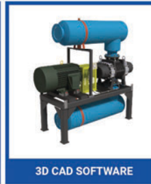
3D CAD SOFTWARE